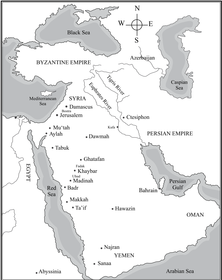
Map of Arabian Peninsula showing places at the time of the revelation of the Quran, 610-632.