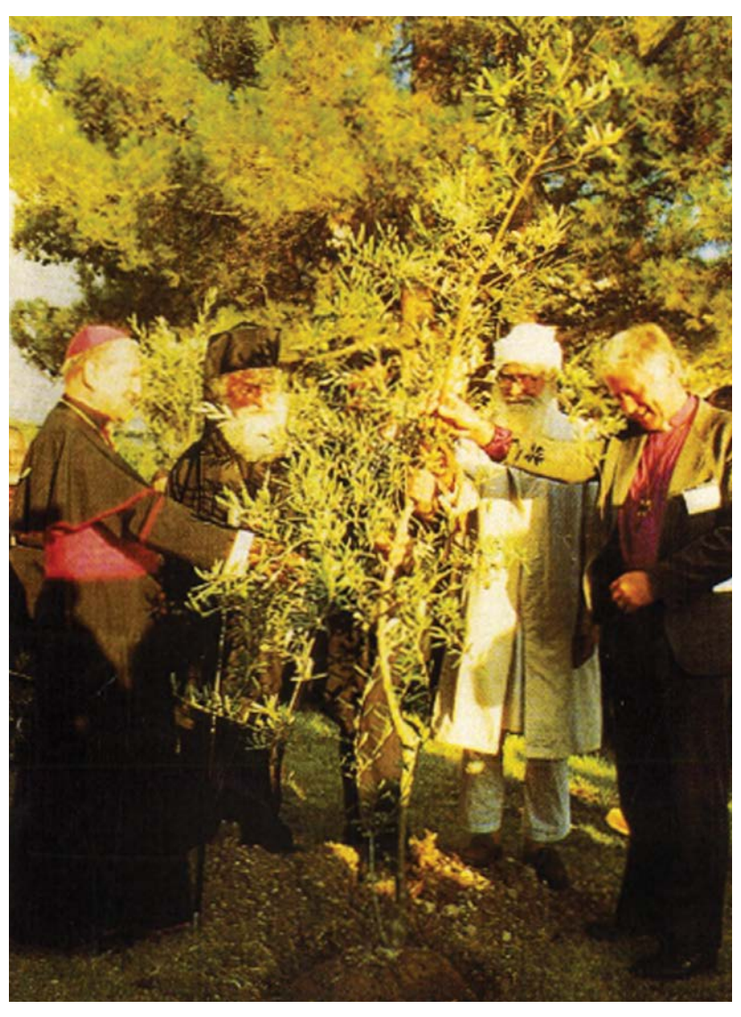
The author, third from left, planting an olive tree in Jerusalem during a peace conference of all religions in 1995.